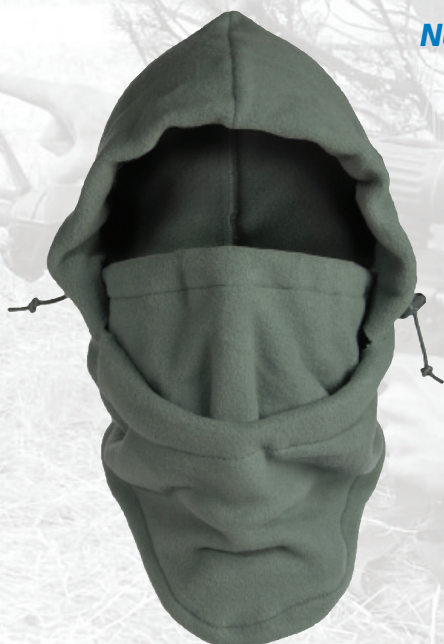
D04F402 Enviowear® Fleece Balaclava

Now treated with DWR for inclement conditions