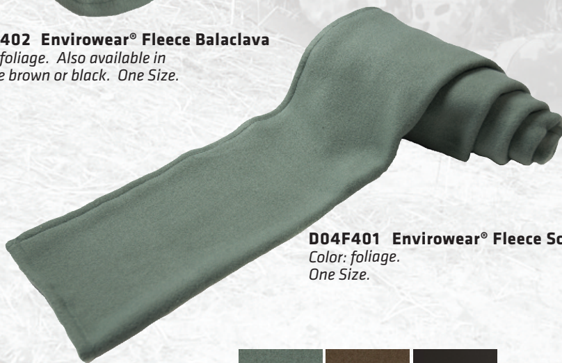
D04F401 Enviowear® Fleece Scarf

Color: foliage. Also available in coyote brown or black. Sizes: S/M-L/XL