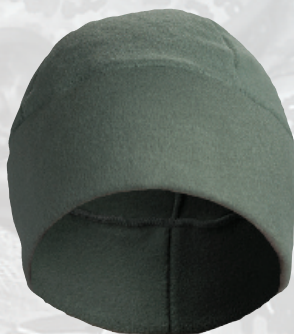
D04F400 Enviowear® Fleece Watch Cap

Color: foliage. Also available in coyote brown or black. One Size.